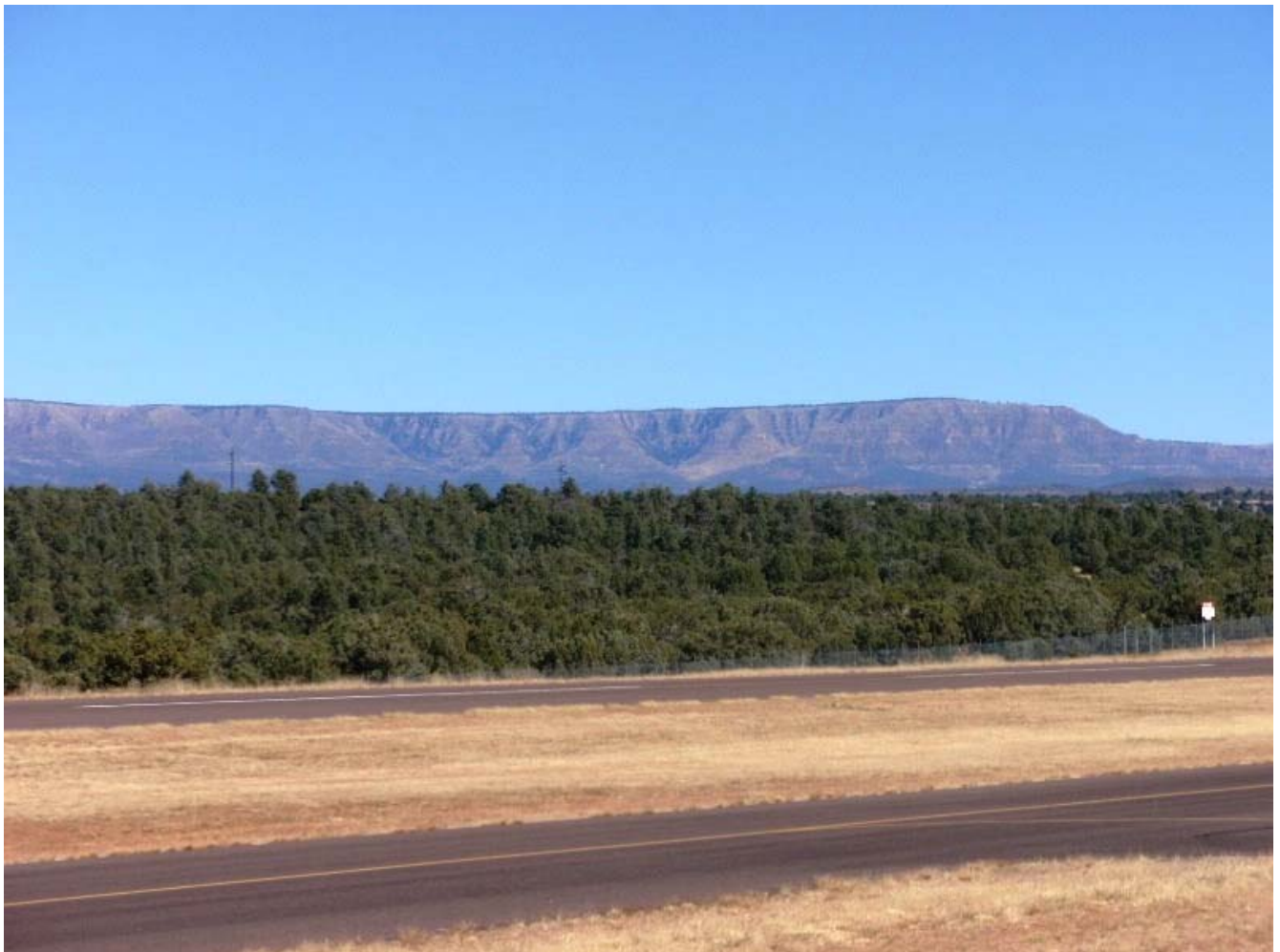
Can you smell the pine trees in front of the majestic Mogollon Rim?