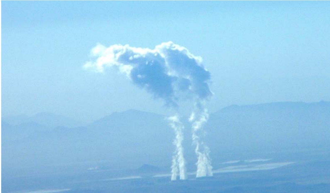
Look what I found out in the middle of nowhere, cloud-making machines