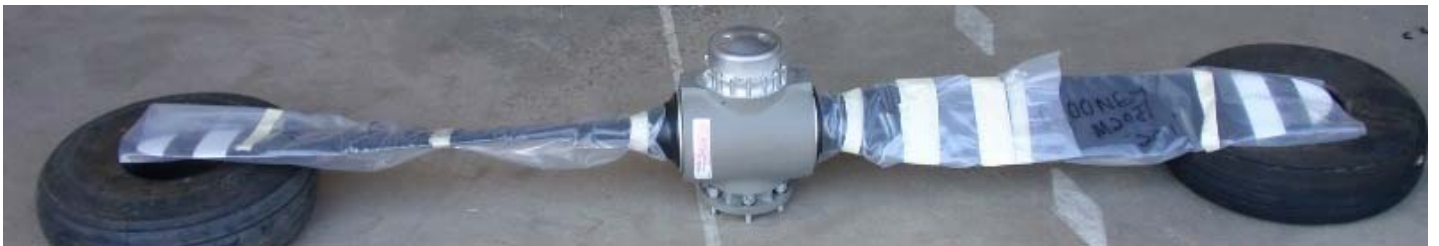
My McCauley propeller was freshly overhauled and ready to be installed again