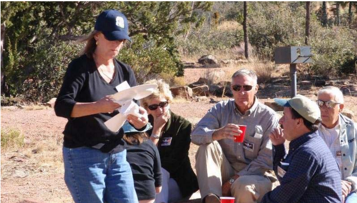
Are we pensive - or just way too serious for such a beautiful day?