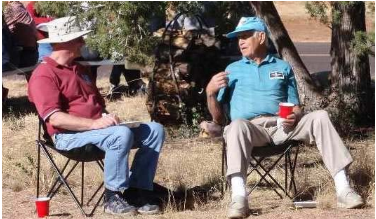
It's my way or the highway!