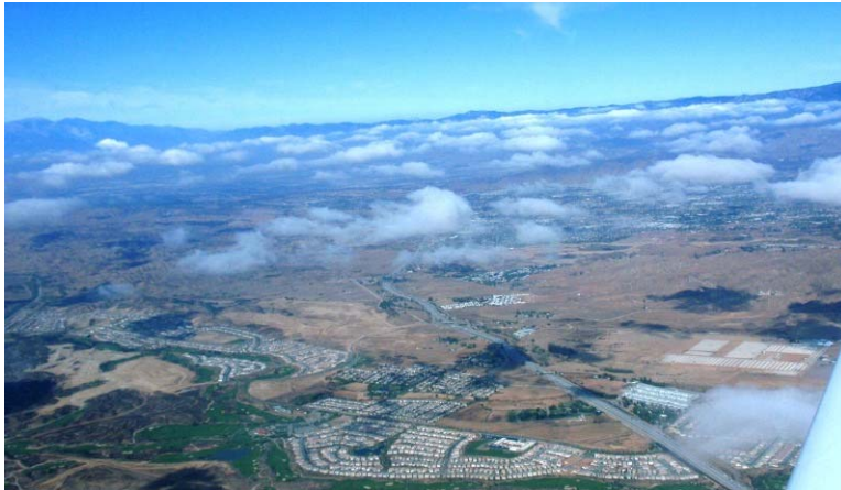
Had some clouds to contend with (down there) in the LA Basin