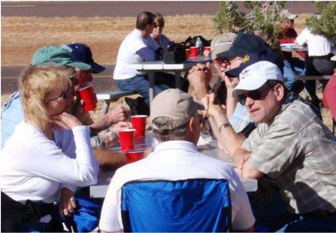
Typical scene of VMG good times with great VMG people after an excellent catered lunch