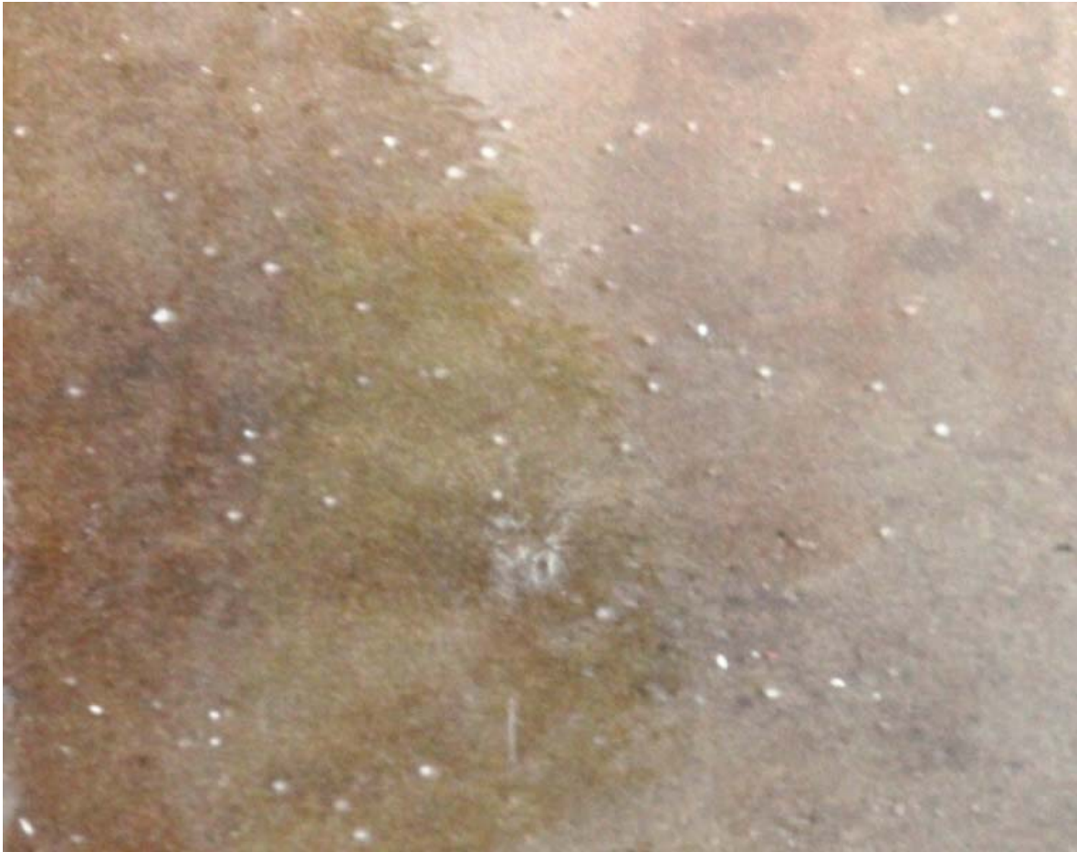
Hail hit the driveway and I was glad that I was on the ground

We were watching NASCAR on TV. It happened to be in Phoenix that weekend. Then all hell broke loose. The rains came. They stopped the race. We knew it would blow our way real soon.