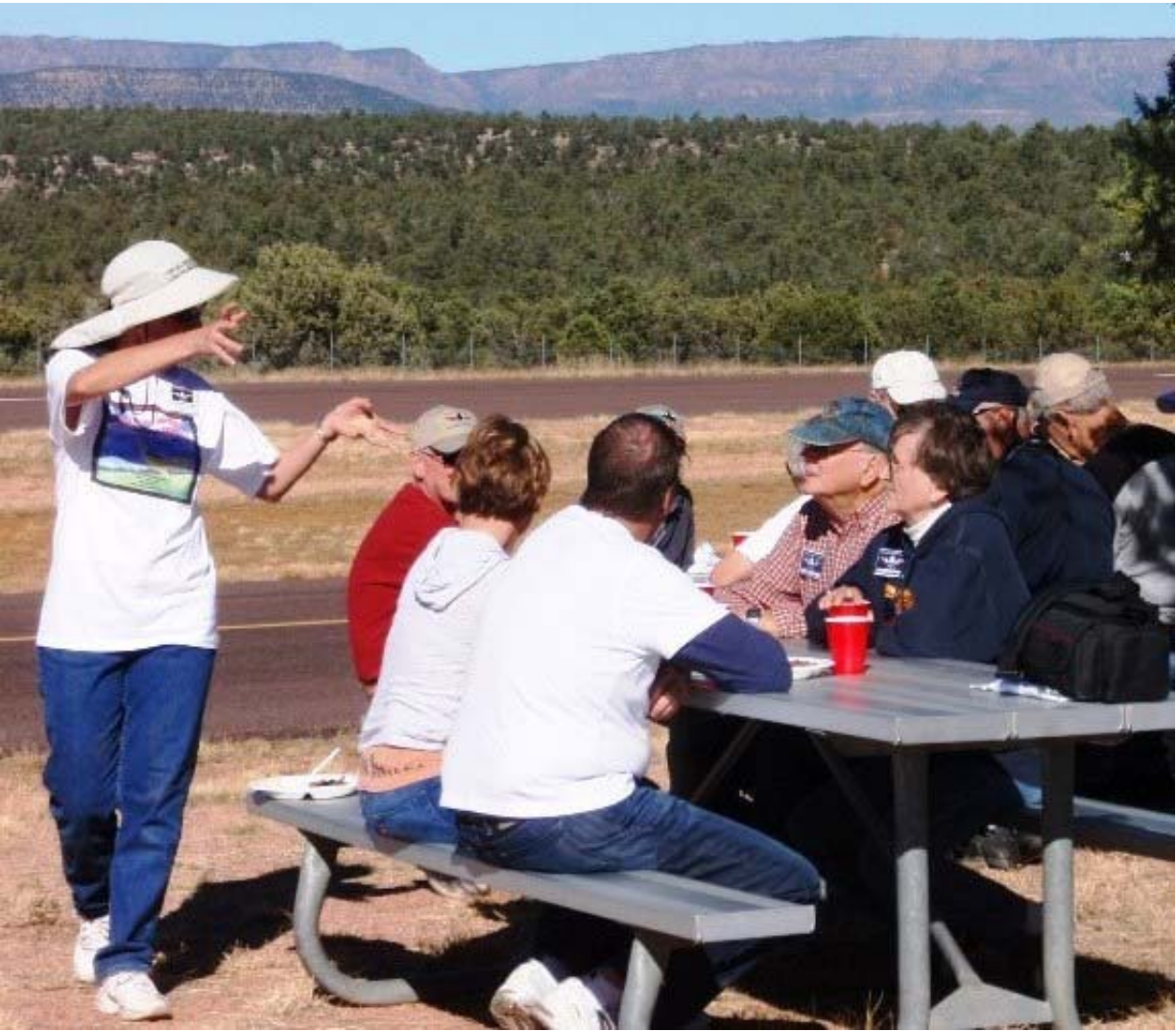
Dance lessons from our movie star were an unexpected plus