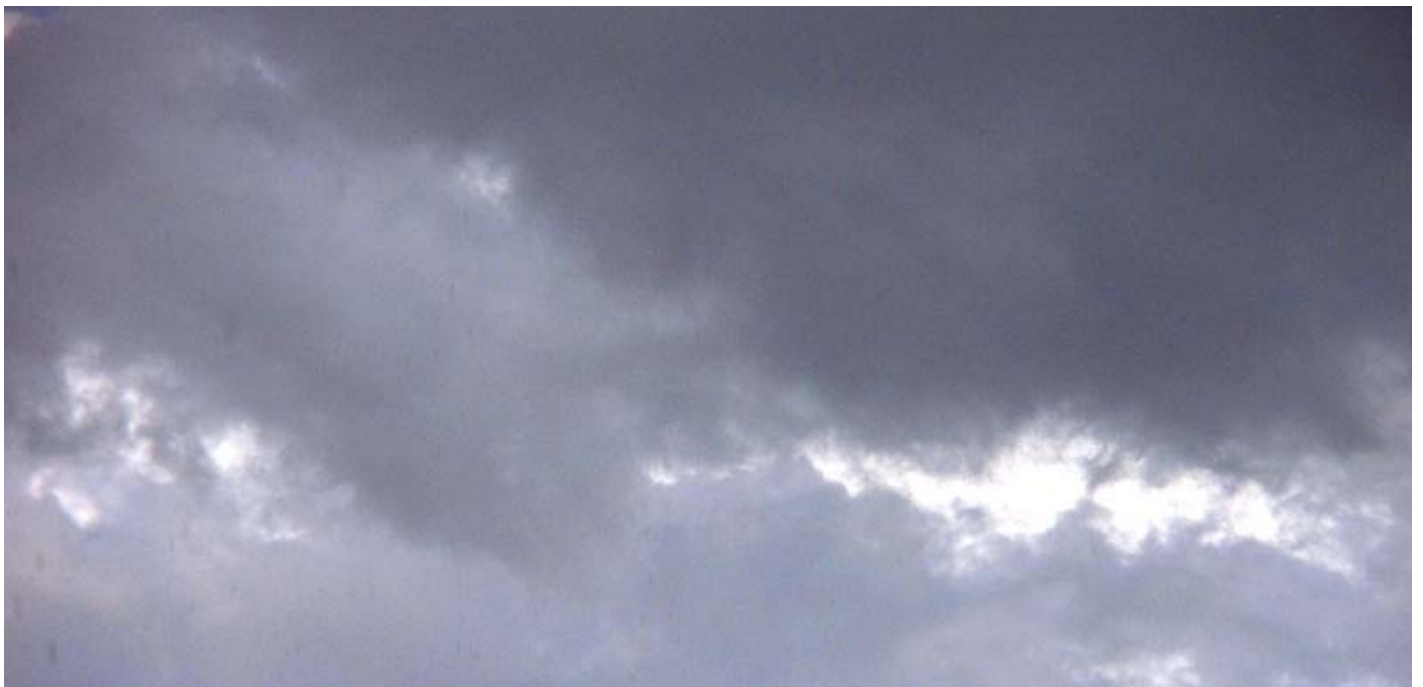
The sky turned really nasty