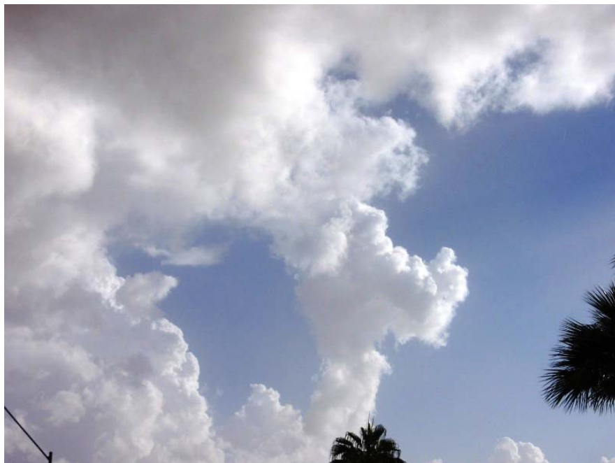
When I got up it was better, but it was not good