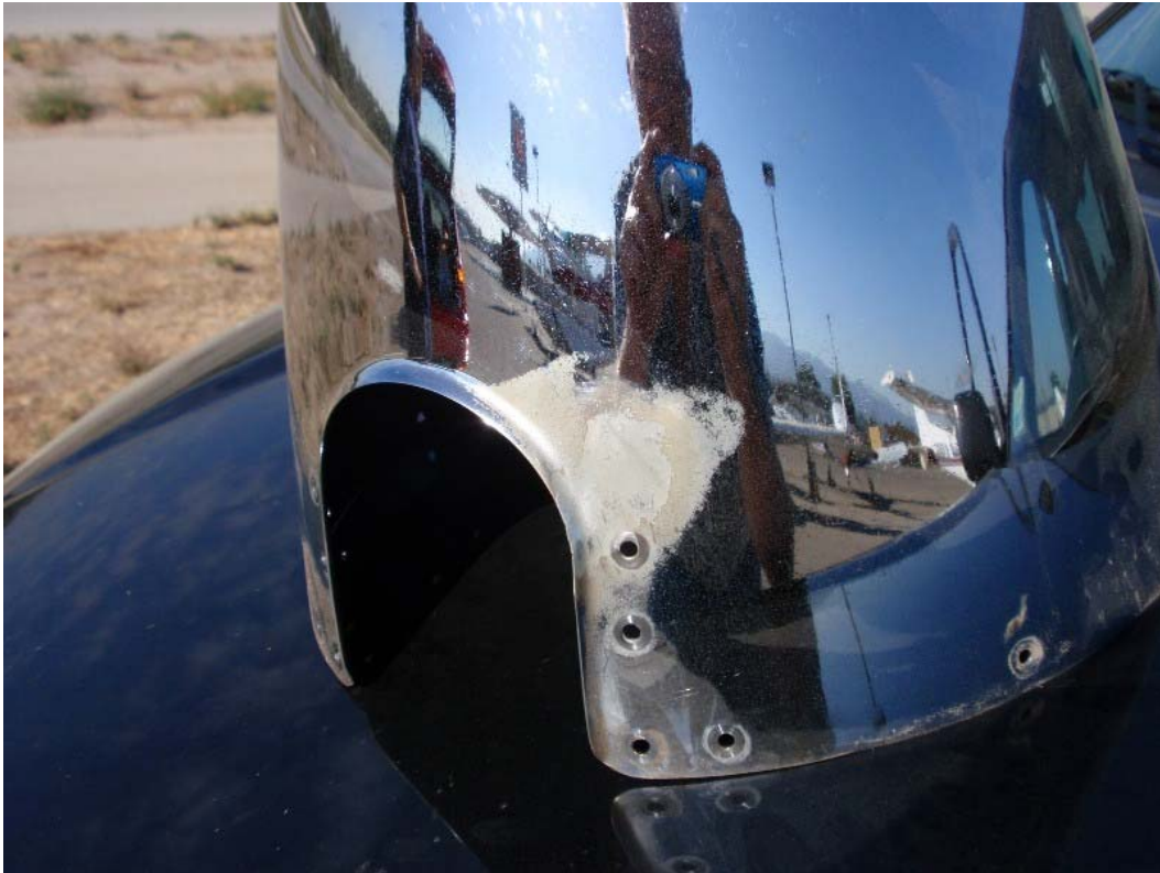
The blemish in the chrome plating that I wanted fixed.