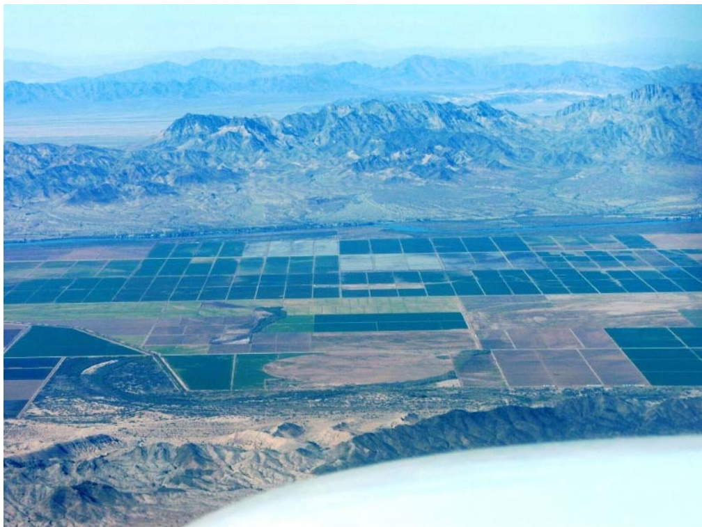
I always love flying through this valley about 50 mi. west of Phoenix