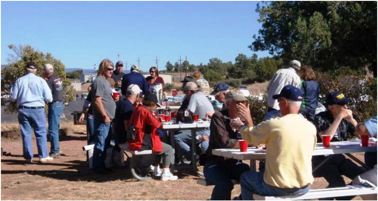
Let me explain this to you