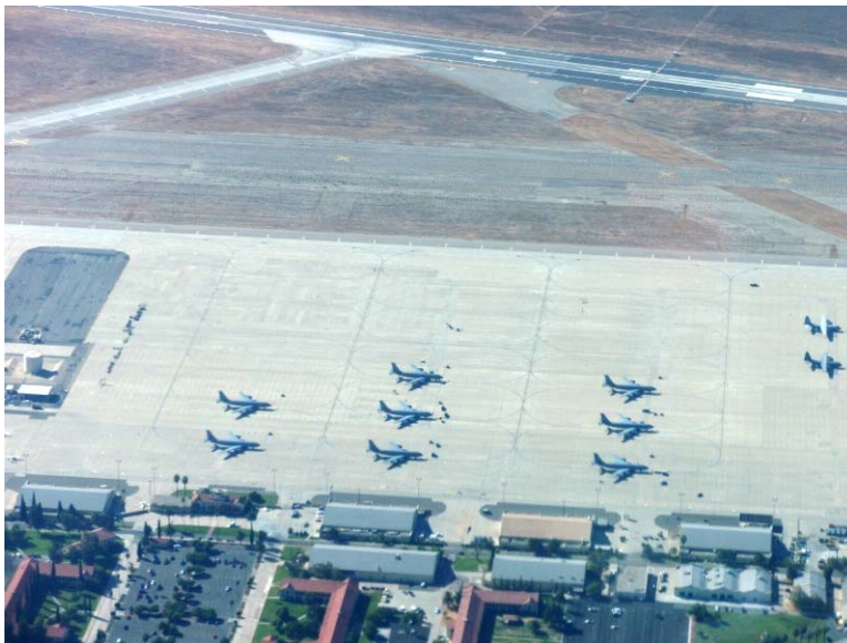
A small piece of March Air Reserve Base sliding by

Plop, bang, splat, I landed in Corona. Jumped out of the plane and into my car, and drove another 24 miles to work. I got there at 11:30 and still put in a full day's work. Whew!