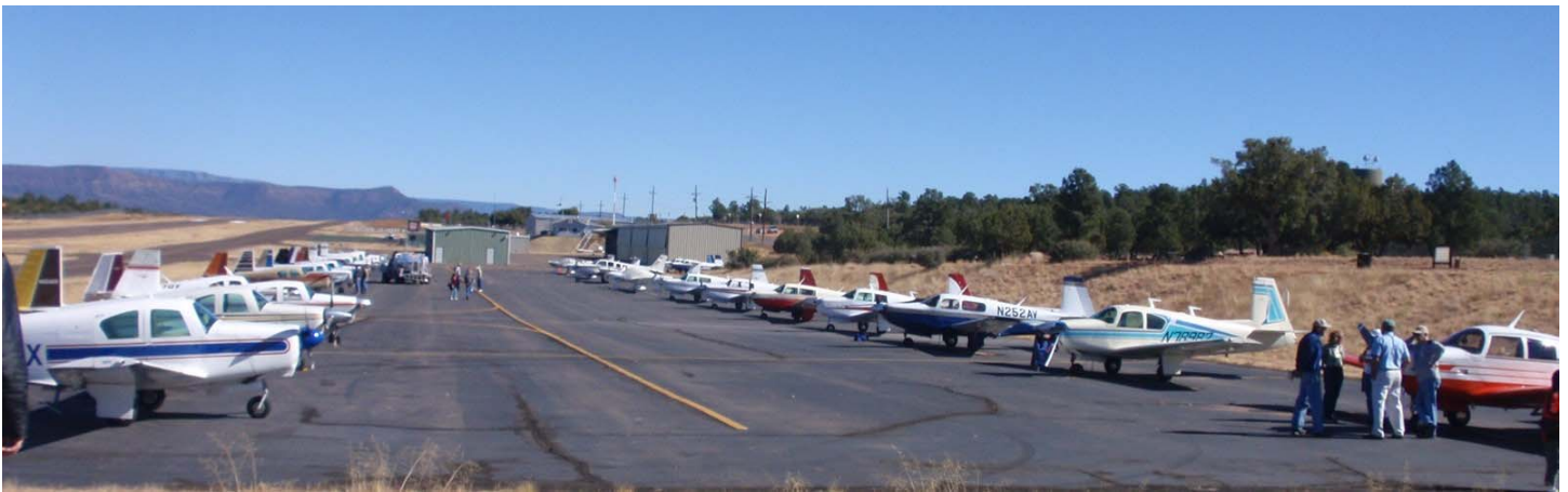
Look at us, Mooneys of every age and color and not a cloud in the sky

Per Mapquest.com, the trip from Phoenix to Payson AZ is "Total Estimated Time: 1 hour 28 minutes." 07T did it in under a half hour. ☺ What awesome weather. Light winds. We couldn't find a cloud anywhere. No bumps - clean air - we could see for 50 miles. Plop, bang, splat, I landed.