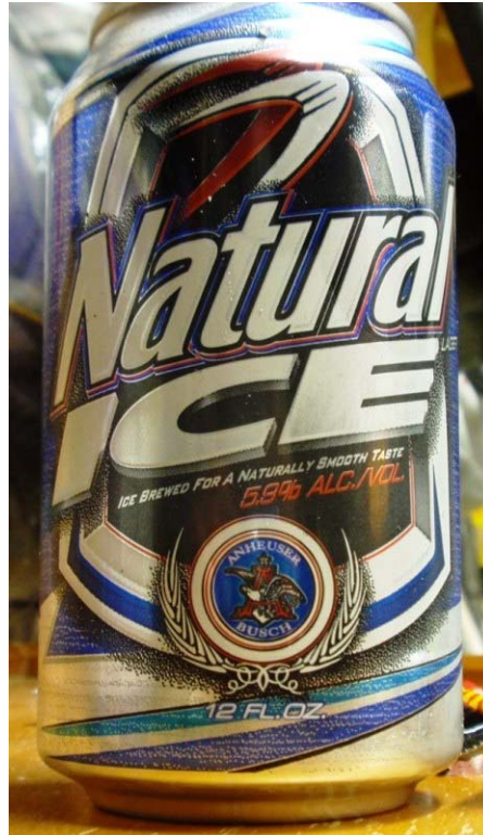
The Infamous Blue Can .

For all of you first timers reading about a Blue Can, I have to spill the beans right here.